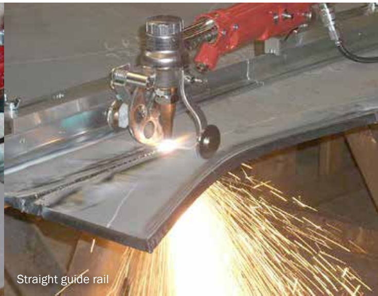
Straight guide rail