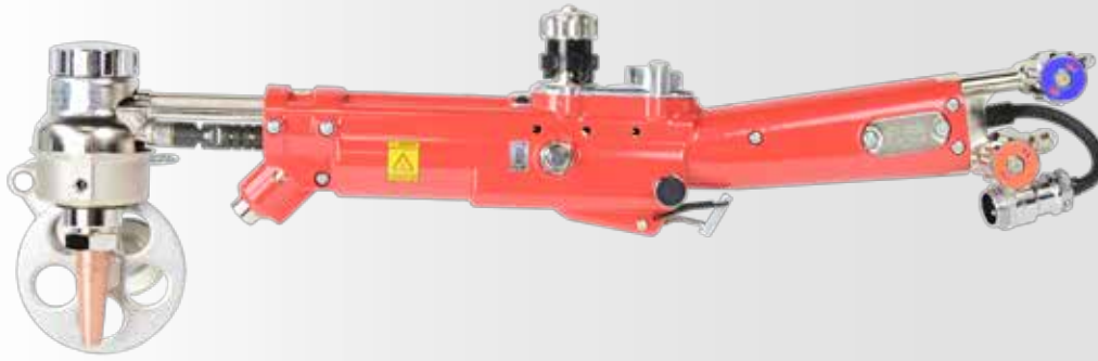
Handy Auto Plus