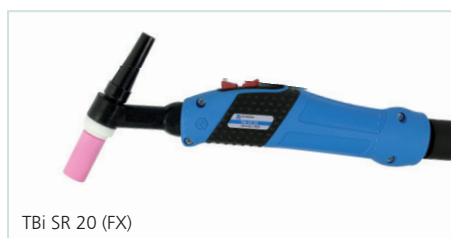
TBi SR 20 (FX)

60% (10 min.) AC: 80 A DC: 110 A Ø 0.5-1.6 mm