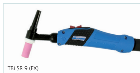
TBi SR 9 (FX)