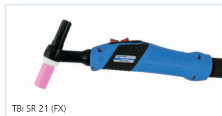
TBi SR 21 (FX)

100% (10 min.) AC: 160A DC: 220A Ø 0.5-3.2 mm